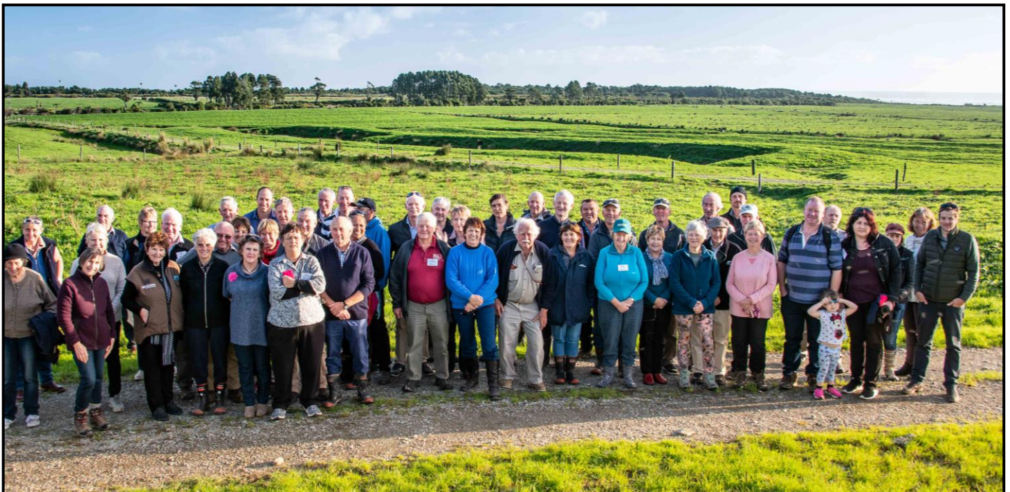
CONFERENCE 2019 ATTENDEES - WEST COAST

As I made mention at the conference dinner the hosting province next year should encourage more commercial farmers to put their flocks up for judging for this special award. As lamb numbers continue to stay static throughout the country the Perendale breed needs to remain at the forefront of other breeds, be it selling into a healthy store market or finishing lambs into the meat processors.